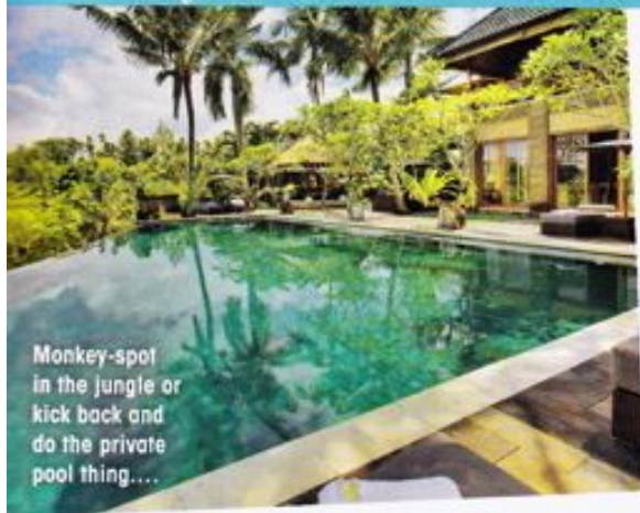
Monkey-spot in the jungle or kick back and do the private pool thing....