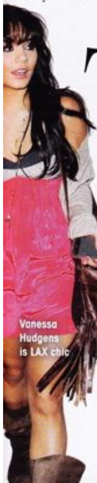
Vanessa Hudgens is LAX chic